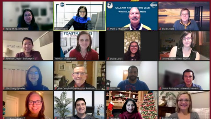
Dec 14 - Best Gift You Received or Gave