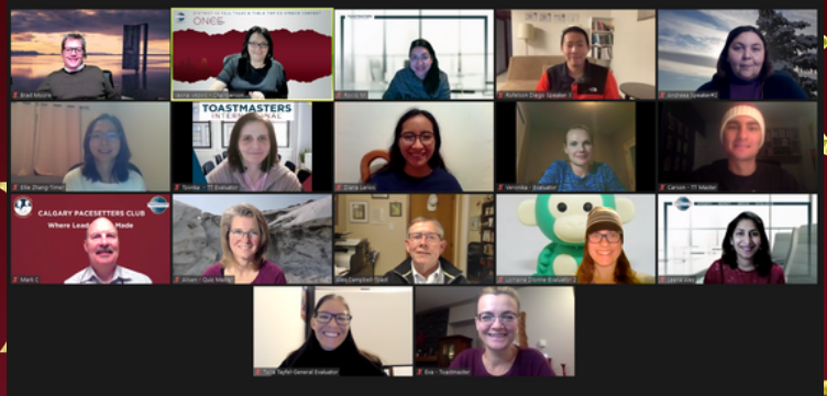
Dec 7 - Naughty or Nice - Childhood Memories