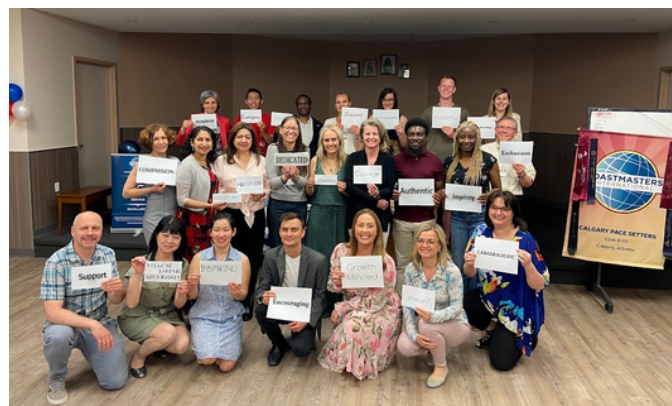
The 2022-2023 Calgary PaceSetters