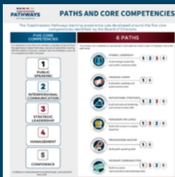
Paths & Core Competencies

To begin, you'll complete an online assessment designed to help you choose the path that best aligns with your goals and interests. From there, you'll have the option to explore these six available paths: